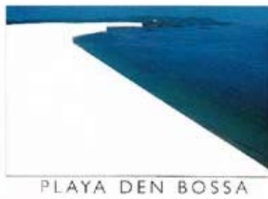
Sara Tur – Érase una vez.