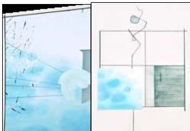
Christian Juan Page – Entretenimiento

Issues eminently pictorial such as the line, stain, material, texture, gesture or color, accompanied by other heteroclite elements that modernity had enabled for artistic expression: the extra-artistic deliberately, the global, the instant, the sarcasm, the recycling, the occurrence, the easy, consuming or paroxysm of unfathomable wealth of images, are used to give expression to an idea of island that speaks more of separation and autonomy than union and dependence.